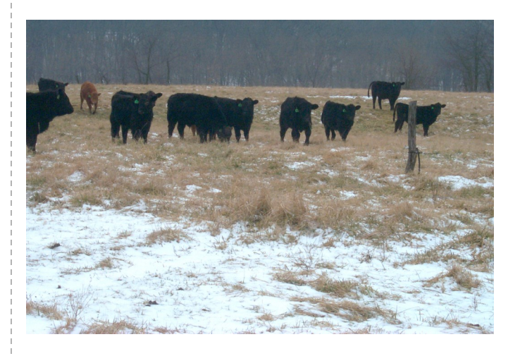
Management Intensive Grazing Schools are presented by: